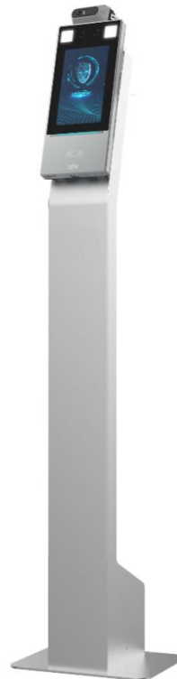
Floor-stand mount (need additional EP-S31-W-NB bracket)